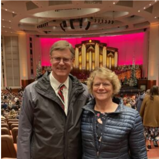
At the Conference Center for the First Presidency Christmas Devotional