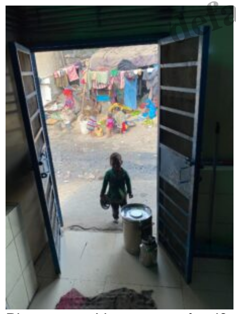
Please may I have some food?

Then there was the small boy who came to the shelter door seeking a handout, and was so polite and patient as some of the leftovers from feeding the shelter residents were scooped onto his plate. He likely was there on behalf of his family, and what he was given might have been his family's entire food supply for that day.