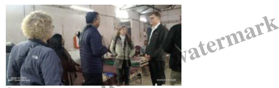
Continuing the discussion

The first two were surprising enough, located adjacently in a somewhat isolated setting. These are not permanent, but portable structures, on government-owned land, barely adequate for their purpose. Then they took us to a similar shelter but in a vastly different setting.