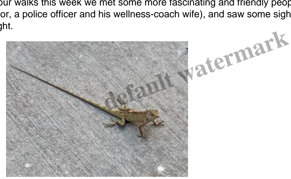
What a straight tail you have!

On our walks this week we met some more fascinating and friendly people (an accountant, a retired doctor, a police officer and his wellness-coach wife), and saw some sights replete with beauty and delight.