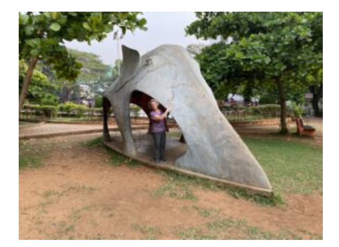
We have a grandnephew who can relate to this next picture. Here's a bonus for you, grandnephew! If