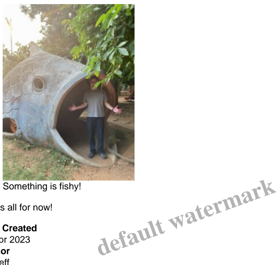
Something is fishy!

you see this by some small chance, enter a comment on this post telling me why you can relate and you'll get a personal private email reply from me!