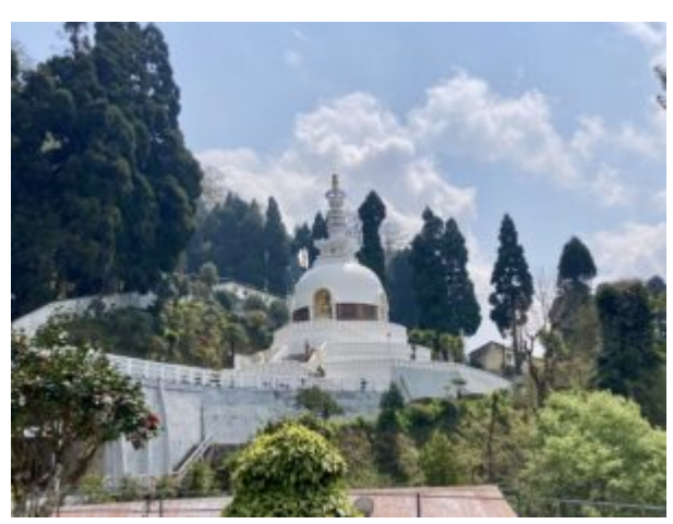
The Peace Pagoda