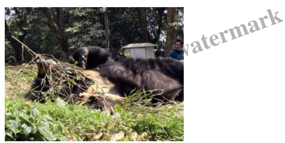
Cute big Himalayan Black Bear

The last thought for this week was the feeling of coming home when we arrived back in Vishakhapatnam. We both felt it and I was very surprised that our flat with no personal touches in this huge city in a foreign country feels like home.