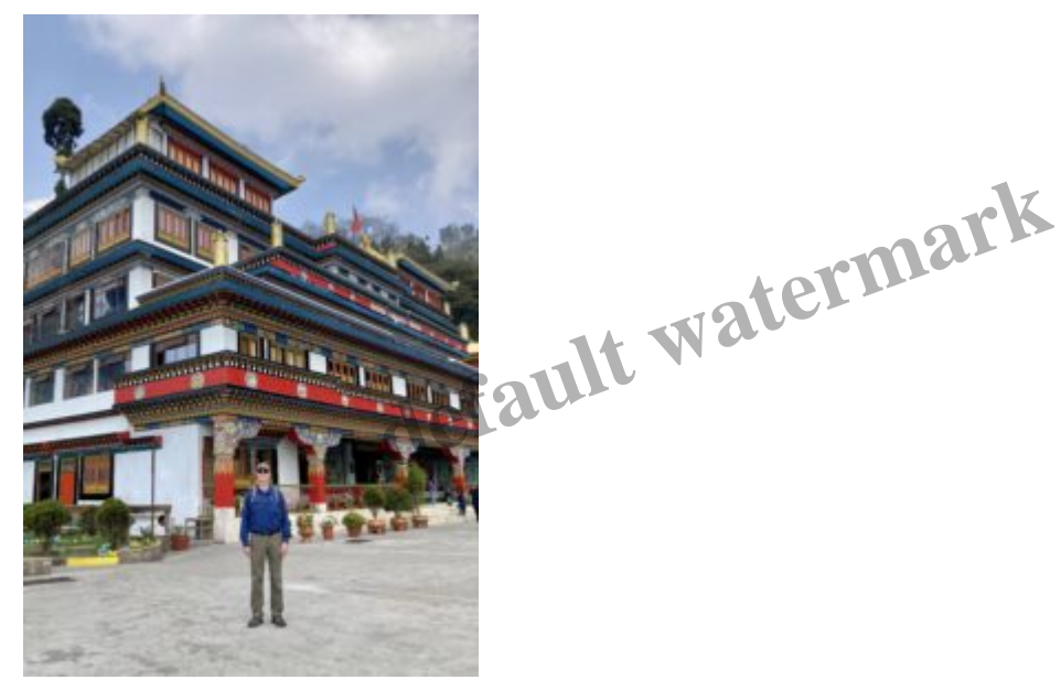
The Main Temple at Ghoom Monastery

http://firstthreeodds.org/wp-content/uploads/2023/04/IMG_4682.mp4