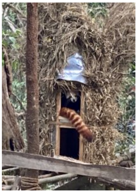
Cute little Red Panda