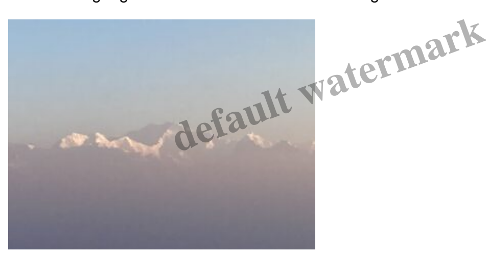
Mt. Kanchenjanga – 28,170 feet. The haze is more fog than pollution. The day before it wasn't visible. We were blessed.

Today we celebrate the resurrection of our Savior Jesus Christ and witness how His glory illuminates us in ways we didn't think possible, cleansing us from deep within to bring light into our countenances that we in turn might glow with His love and share that light with others. He restores my soul.