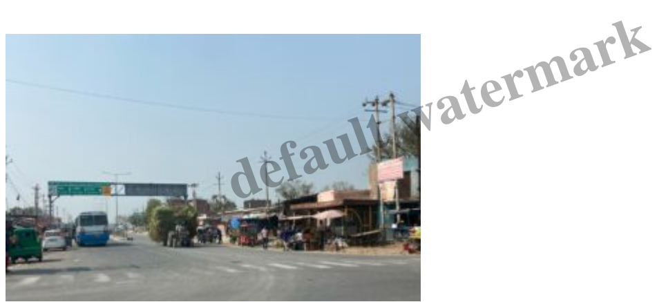
What a variety of sights at the intersection.