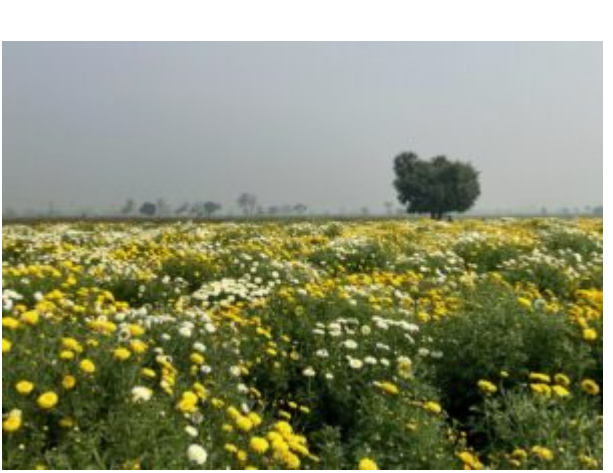
Fields of marigolds where they pluck flowers for garlands