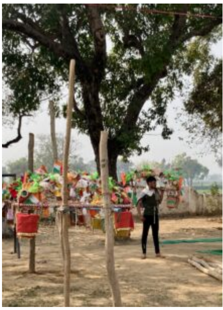
One of the water bearers ready to continue his journey

t watermark While traveling along the backroads we encountered young men who were carrying decorated bow-like contraptions with containers of water attached. They were traveling with sacred water from the Ganges river and taking it to a Hindu temple. It was about a 250 km trek and the processions were accompanied by other people, support vehicles and there were resting spots along the way. It was all part of the Mahashivratri celebration.