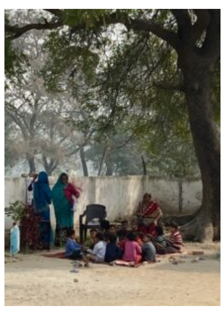
A class of younger children