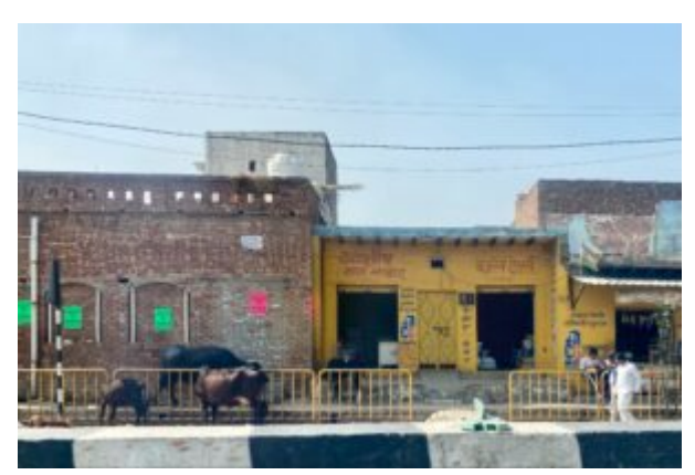
Water buffalo outside a business

Woman in a bright sari talking on her cell phone as she rode in the cart pulled by a bovine.