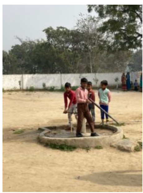
Children at the well pump. It was apparent that they were taught the need to wash after using the toilet.