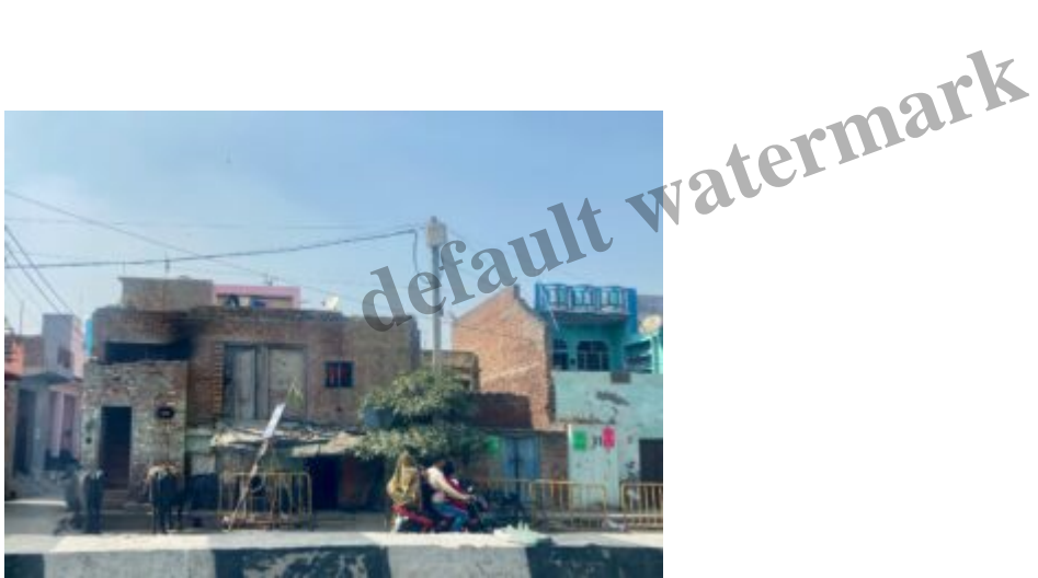
A couple of water buffalo in front of a residence. There were a lot but it was hard to get a picture from the car.