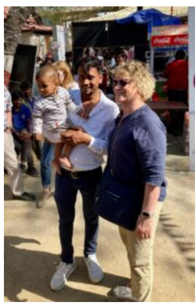
The parents wanted me to hold their baby but he would have none of that.