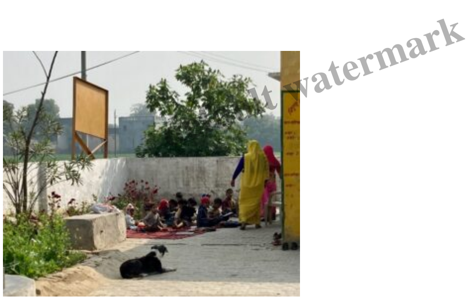
Another class of youngsters at a different school