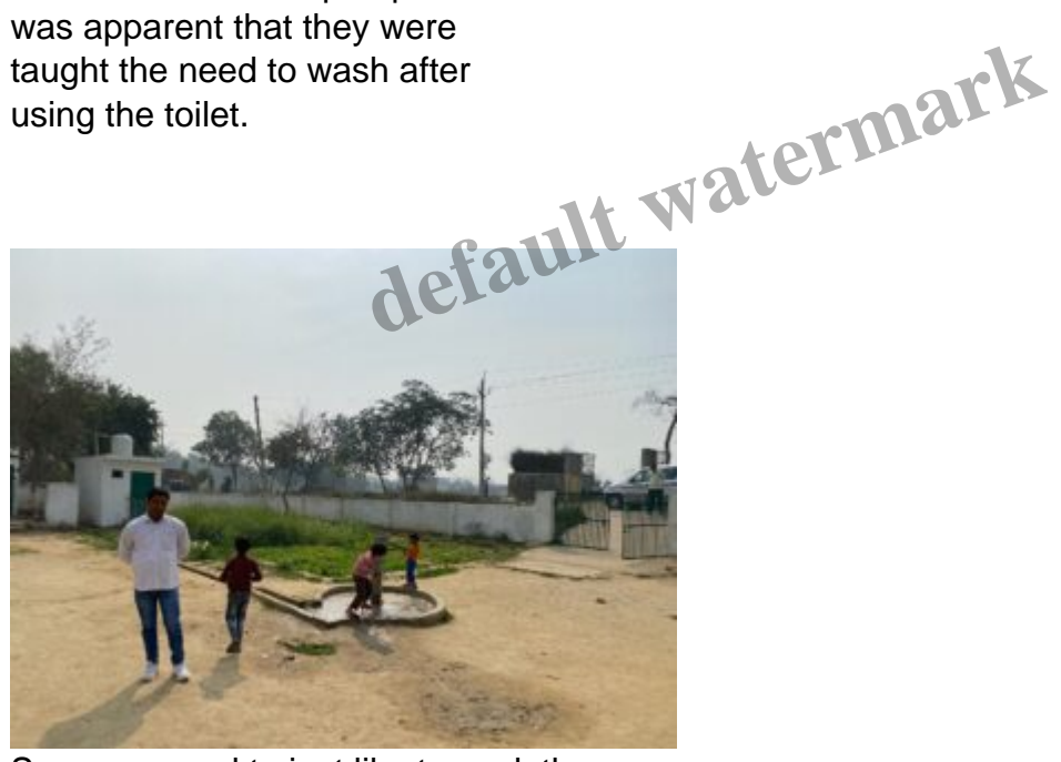
Some seemed to just like to work the pump and play.