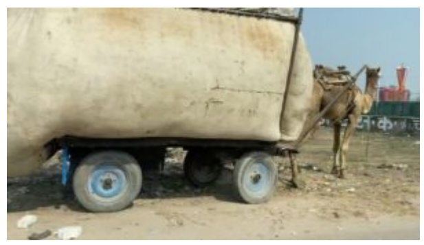
What? A camel pulling a bulging bag of fodder!

I have no great insights from this week, just the realization that no amount of words or photos can relay