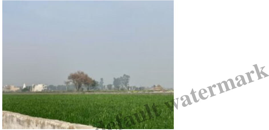
Looking over the school wall across the field to a Hindu temple and other buildings

The children in these rural schools were absolutely adorable. They are very polite and well behaved. Some had uniforms, some did not. Some had shoes, some did not. They all had big brown eyes full of curiosity as we walked around their schools. It was a long 8-hour day but very rewarding.