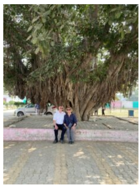
national tree of India, located at the second to last school we visited.

and other water containers waiting to be picked up.