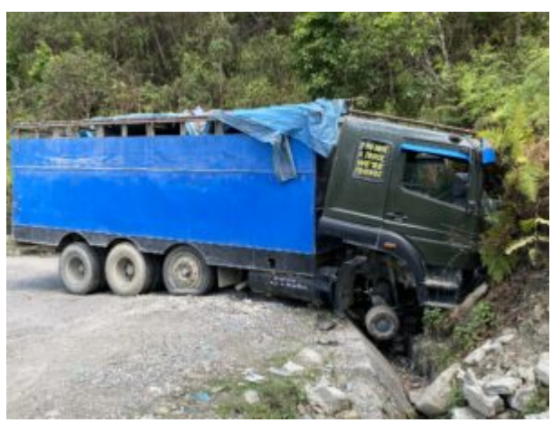
Not every vehicle had as good a driver as ours!

The accommodations were very nice, although it's still weird to have a shower just stick out of the wall next to the toilet, no separating wall, no stall, no curtain, nothing! (Just like in our hotel in Birtamod.) Our rooms did not have numbers, just names of sacred Himalayan peaks: ours was Gaurishankar, the Wolfgramm's, right across from us, was Kanchenjunga (the one we saw from Darjeeling).