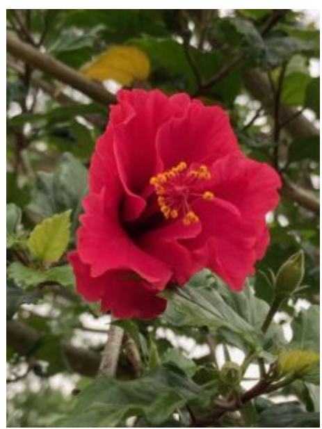
A beautiful flower