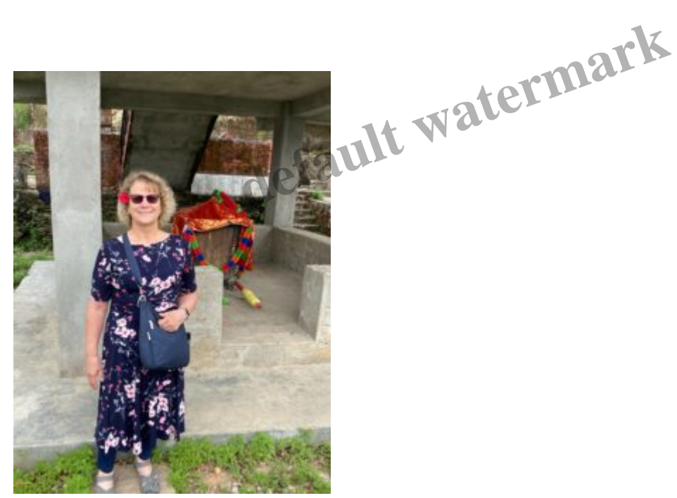
For my favorite girl!

The opening ceremony followed a bit of celebration of the dignitaries (us!), including the mayor of the municipality whose meeting hall was donated for the ceremony and the training. 35 young trainees were there, including 19 women, some to learn bricklaying, the others plumbing. They were all happy to be there and celebrate the occasion.