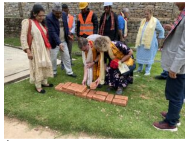
Our turn to lay bricks

Ceremonial bricklaying — the man crouching is the mayor, who started it off.