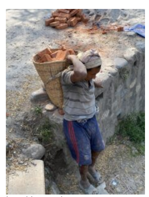
Load 'em up!