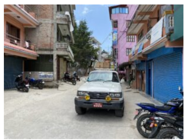
Our reliable 4-wheel-drive vehicle

Hotel Ambrosia was Wednesday's, our first day's destination, a 6-hour drive from Kathmandu. The road is paved, we were told, but our driver had to negotiate many stretches of severely damaged and bumpy pavement on even more narrow, twisty mountain roads than we encountered en route to Darjeeling! Happily, his expertise and 4-wheel-drive vehicle saw us there safely.