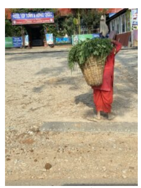
How do they do that?!