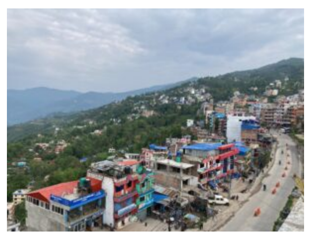
View of Charikot from Hotel Ambrosia