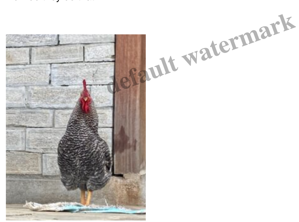
Pretending to be a statue

What really got our attention this week? Food from home! Real maple syrup! Heavenly bacon bits! Not pictured, a 20-oz bottle of A&W Root Beer!!