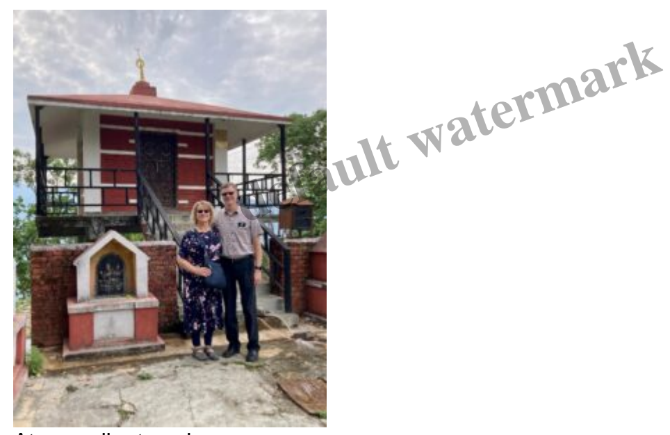
At a smaller temple