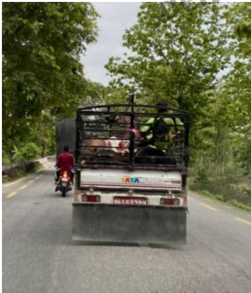
Truckload of pigs we saw on our way to visit a hospital. Note the guy sitting on a rope “hammock”.

Besides the training we also visited four hospitals to evaluate their needs and see how they are implementing the program with things like resuscitation kits, postpartum hemorrhage kits and a practice corner. It is amazing what they can do with so much less than what we have in the US. There was a lot of difference between the government hospitals and the private one we saw.