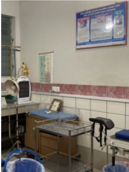
Birthing room in a pretty nice hospital.