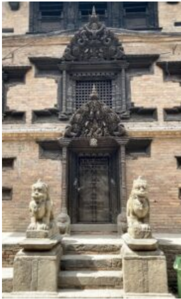
Another example of wood carving.

wooden fretwork that you see all over the Kathmandu Valley.