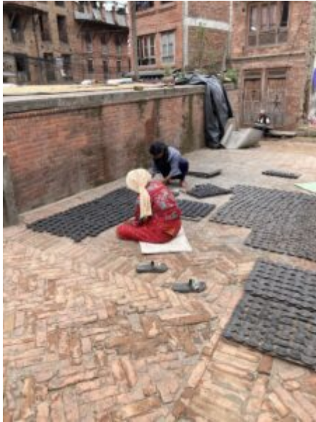
Women setting out little clay “candle” pots to dry. There is wheat drying on the platform above their heads.