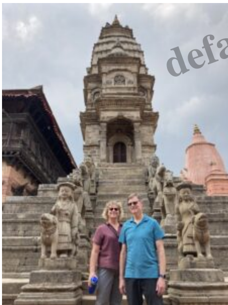
Us in front of one of the many temples.

It has been an exhausting and rewarding week. We are getting settled in and gearing up for the coming week. We’re grateful for all of the prayers in our behalf and to finally be here doing work that matters and helping the people of Nepal.