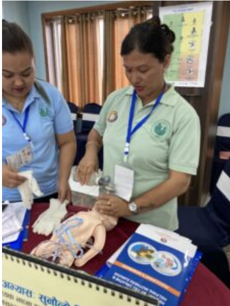
“Bagging” NeoNatalie so she can breath.

Besides the training we also visited four hospitals to evaluate their needs and see how they are implementing the program with things like resuscitation kits, postpartum hemorrhage kits and a practice corner. It is amazing what they can do with so much less than what we have in the US. There was a lot of difference between the government hospitals and the private one we saw.