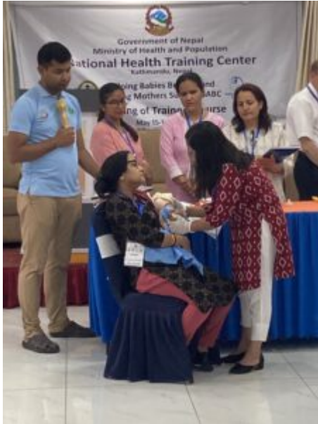
Just “delivered” mannequin NeoNatalie.