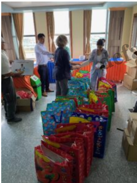
We filled bags with equipment and supplies for the participants to take back to their facilities.