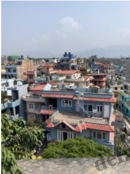
View of the neighborhood from our apartment.

We had an uneventful flight to Kathmandu and “enjoyed” a repeat of our Indian airplane lunch menu for dinner. We were actually grateful for the food since we had not had time to get anything at the airport. Our driver was waiting for us upon arrival and greeted us with the traditional scarf to place around our necks. We arrived at our apartment at about 10 pm and had fun carrying all that excess baggage up to the 5th floor. It took teamwork.