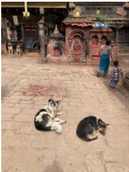
Two dogs “guarding” the way to the temple. Note the two dog statues guarding the doorway.