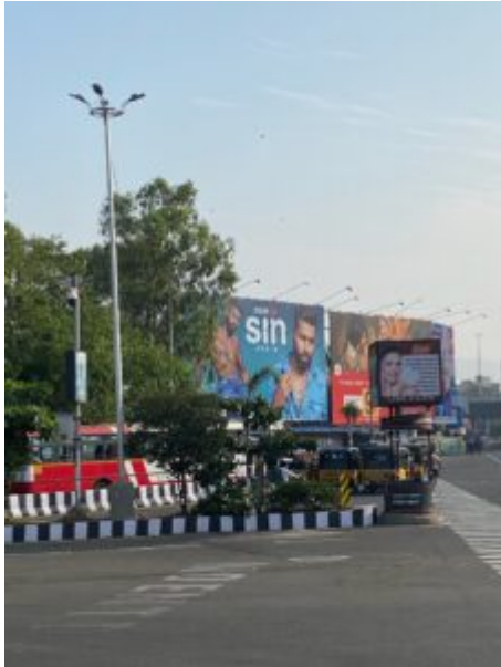
Own UR SIN

(SIN is a brand name, derived from their slogan “sinfully stylish clothes for men”.)