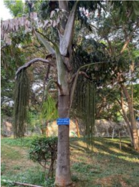
Fish Tail Palm Tree