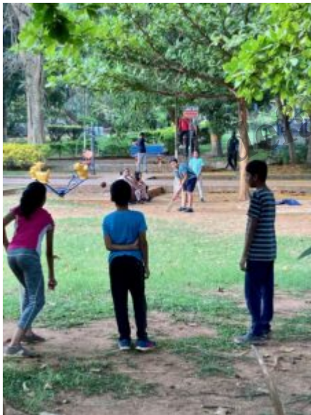
Kids playing cricket

From this morning's walk at Sivaji park: