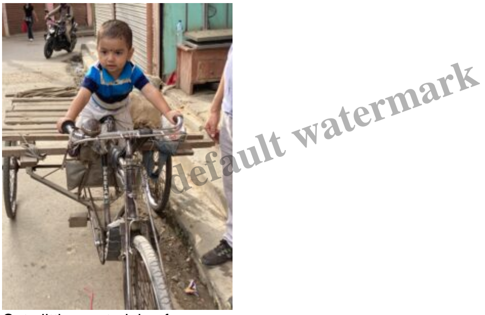
Cute little guy training for deliveries