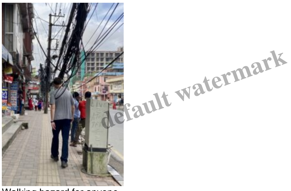
Walking hazard for anyone taller than your average Nepali