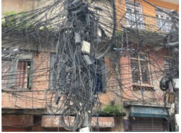
A typical rat's nest