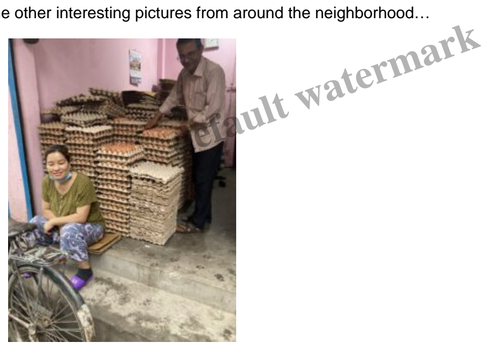
The shop where we buy our eggs