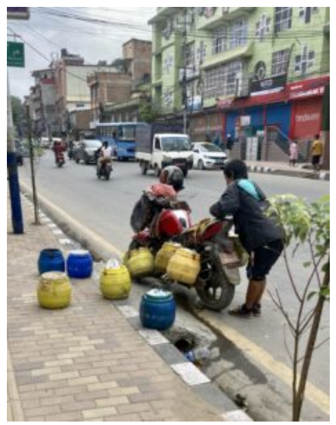
A man collecting "pig pots". Restaurants put waste food into the pots and they are gathered to take to feed to the pigs.