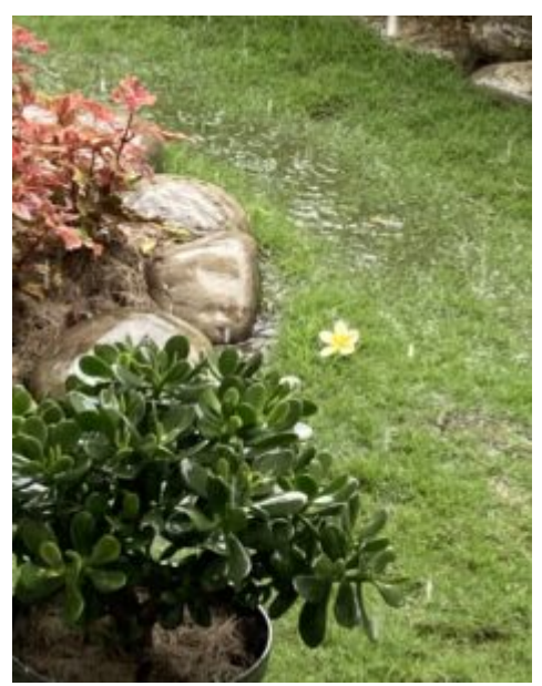
Our soggy backyard

hard to not do a second rinse while the clothes are hanging on the line!