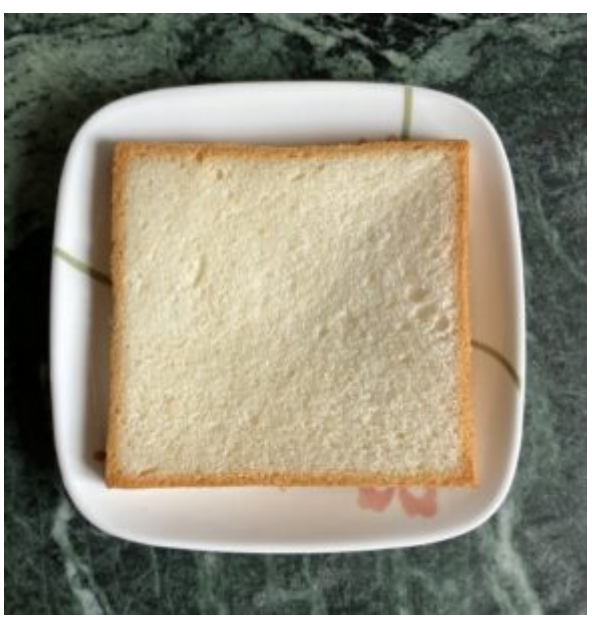
Very square bread on a square plate.