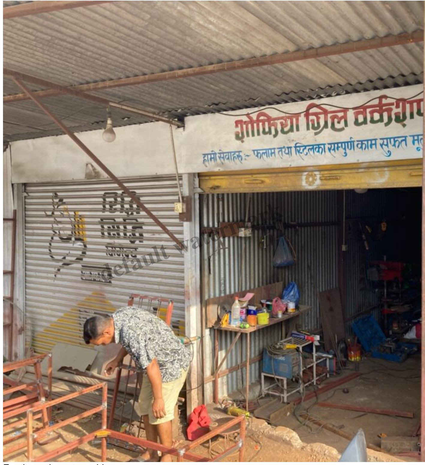
Furniture shop streetside