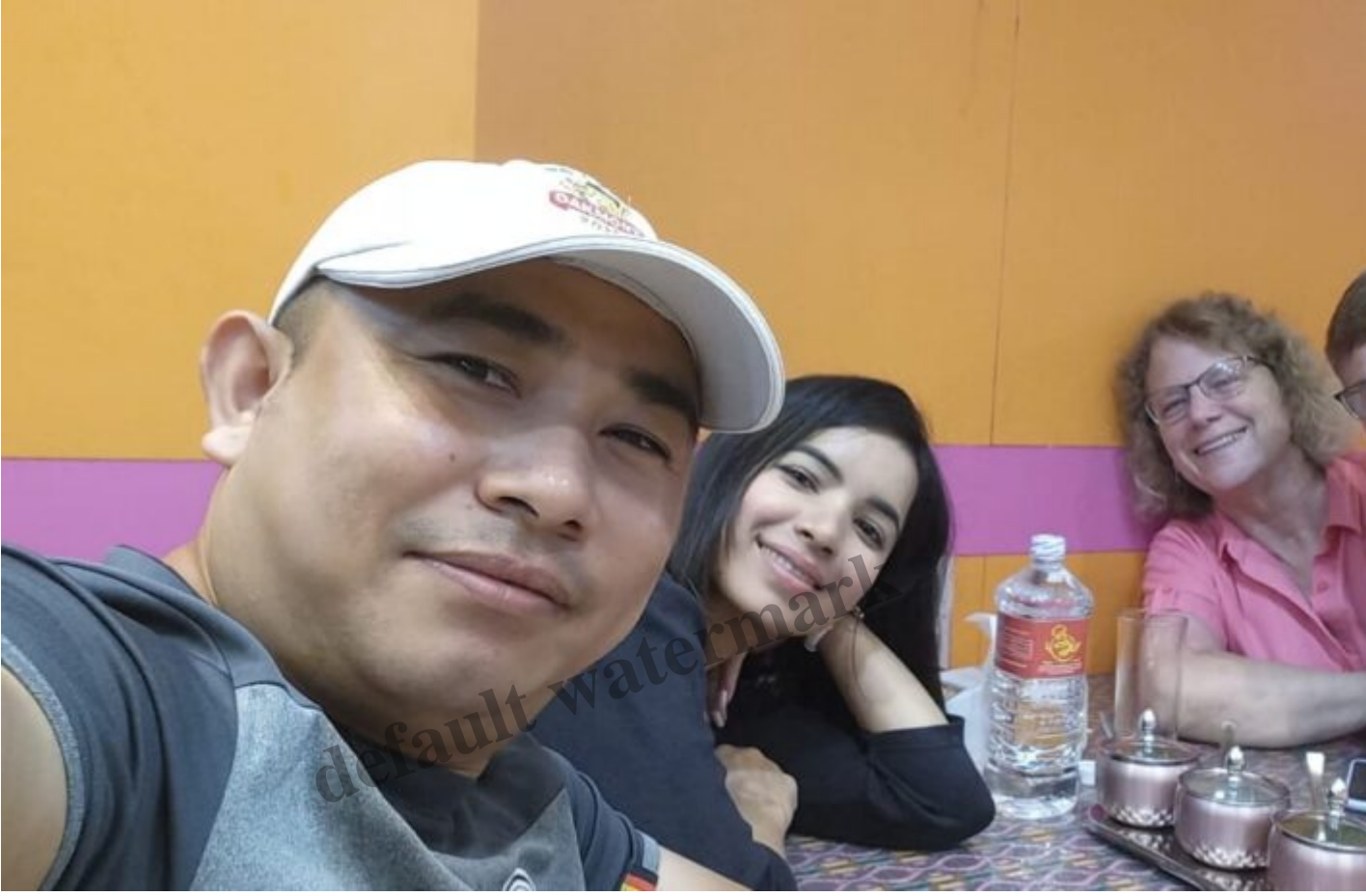
Happy diners after eating

On Wednesday Kiran called to ask if we wanted to go see where they were making the benches and desks for our school furniture project. We did! It was fascinating to see the furniture maker in his shop and the end result (minus legs — they will be welded on after delivery to the schools — less effort and more efficient to transport them unassembled).