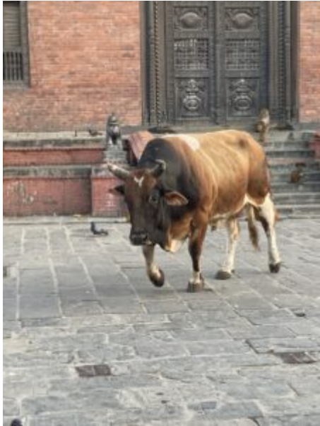
An impressive bull wandering the grounds