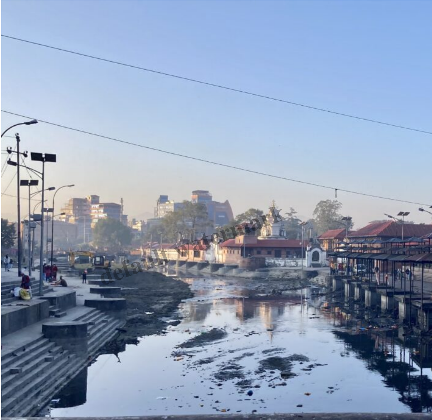
Funeral pyre beginning to burn and wood laid out on other platforms in preparation