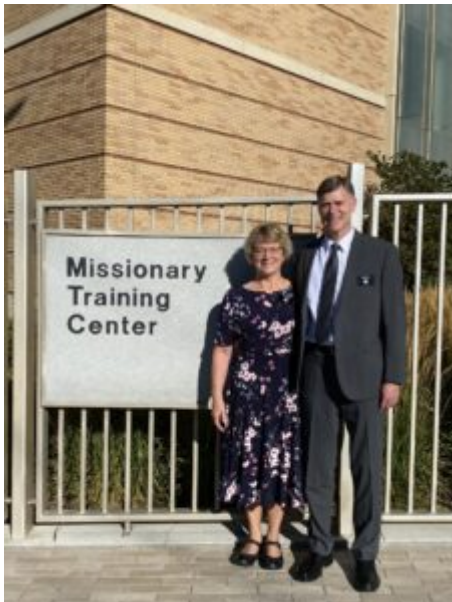
Monday morning arrival.

From this week's experiences we have a greater desire to overcome the natural tendency to turn inward by showing Christlike love to all those around us and feel we will have plenty of opportunities to do that as we serve as missionaries. Developing Christlike attributes is a lifelong journey on which we progress one step at a time.