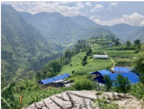
Part of the village