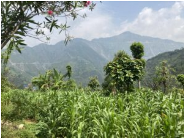
Cornfield near the school. They practice symbiotic growing with beans and squash among the corn.

It was a two hour drive into the hills on rough winding roads. We have submitted a project plan for this area (not just this village) to enhance their agricultural practices so it was especially fun to see and also meet the people including the municipality mayor and the chief officer of the ward. The villagers were very friendly and excited to have us there.