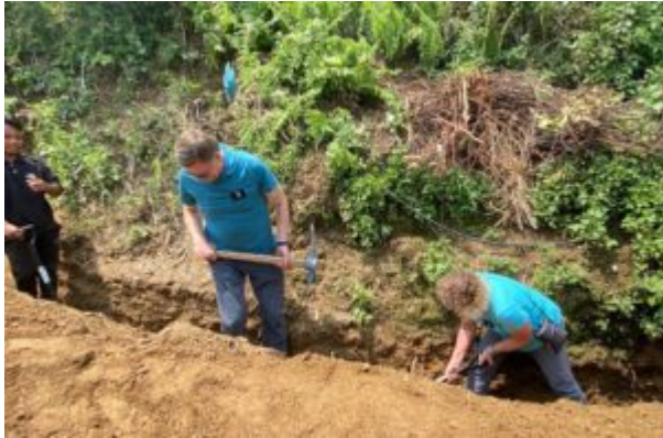
We contributed a few token shovels full