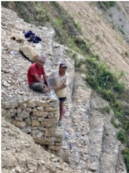
Notice the OSHA approved footwear

filling cages with rock and creating a stable base for the road on the downhill side and a wall on the uphill side. What was most impressive was the level of comfort they showed while working on a steep hillside. They accomplish amazing work with hand tools. There was a big backhoe that was moving the large rocks.