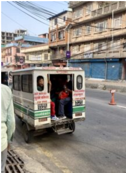
A Tempo loaded with people.

I'm not planning to haul around loads like those we have seen here. What they haul and how they haul it fascinates me. I have shared some pictures in earlier posts but here are a few from this week.