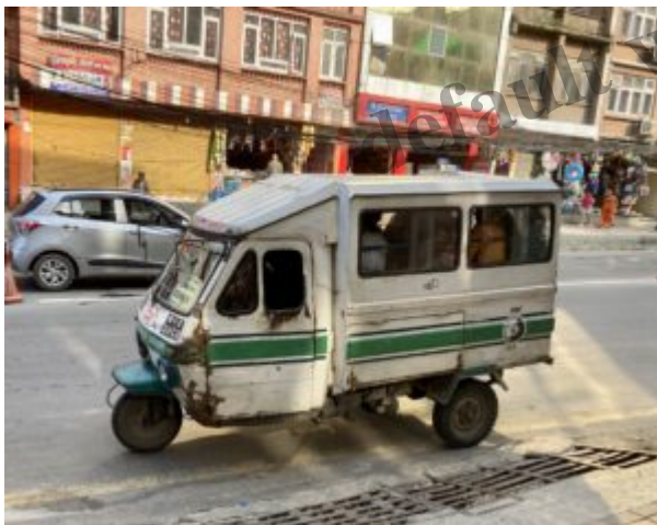
There were 8 or 9 passengers in this small bus-like mode of transportation.