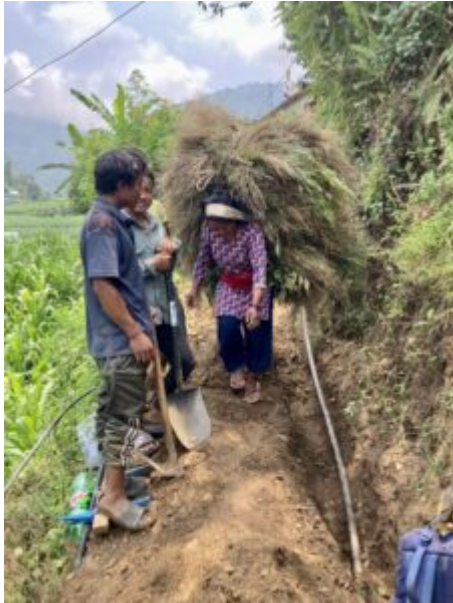
Carrying fodder for the goats and water buffalo.

We each carry our own load or burden. Often these are not seen and we don't realize how heavy they have become. We can ease these burdens by yoking ourselves to the Savior. His love allows us to repent and as we cast off the burden of sin we lighten our loads. We can all enjoy the blessings of lighter loads as we turn to our Savior. Through loving service we lift the burdens of others. We don't have to join an expedition to help. As Dieter F. Uchtdorf said, "Lift where you stand".