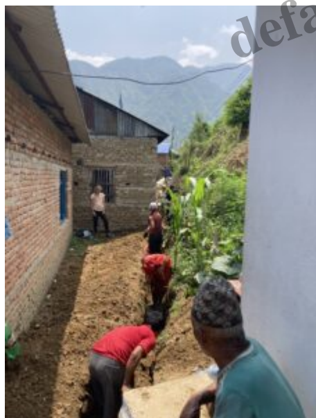
Villagers and volunteers digging the trench

The second group came with Choice Humanitarian, the NGO we have several current projects with, and included more families or parent and child units. They were also amazing people. The project we visited is a water project where the group, along with villagers, were digging a trench to lay pipe and bring water from the source so that each home can have a spigot and convenient water for home use as well as irrigation.