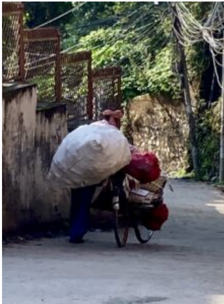
A load of recyclables.