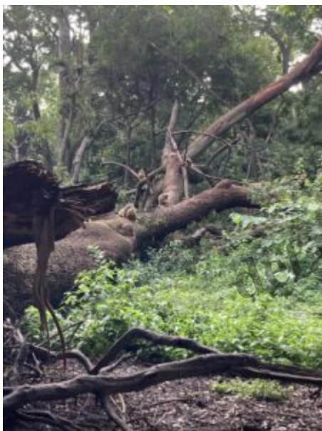
Seven little monkeys sitting on a log