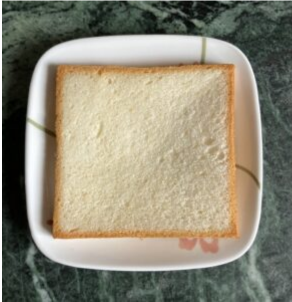
Very square bread on a square plate.