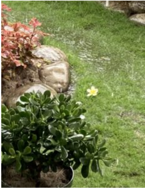
Our soggy backyard

hard to not do a second rinse while the clothes are hanging on the line!