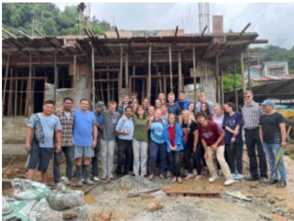
The last HXP group