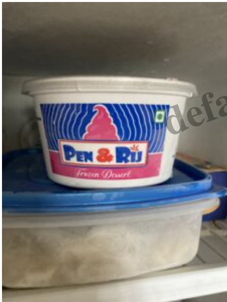
Pen & Rii, Nepali Ben & Jerry's?

Dejunking and recreating our flat to better suit our needs has been rejuvenating. I think that as we eliminate clutter from our minds and our lives we are better able to feel the influence of and be directed by the Holy Ghost. I know that as we serve here in Nepal we need all the help we can get!