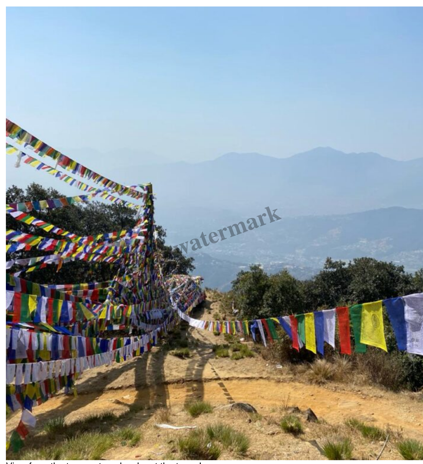
View from the top — stupa level, not the tower!