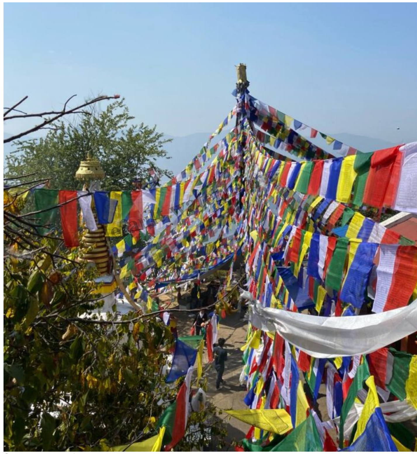
So many prayer flags!

For worship — a challenging place to get to!