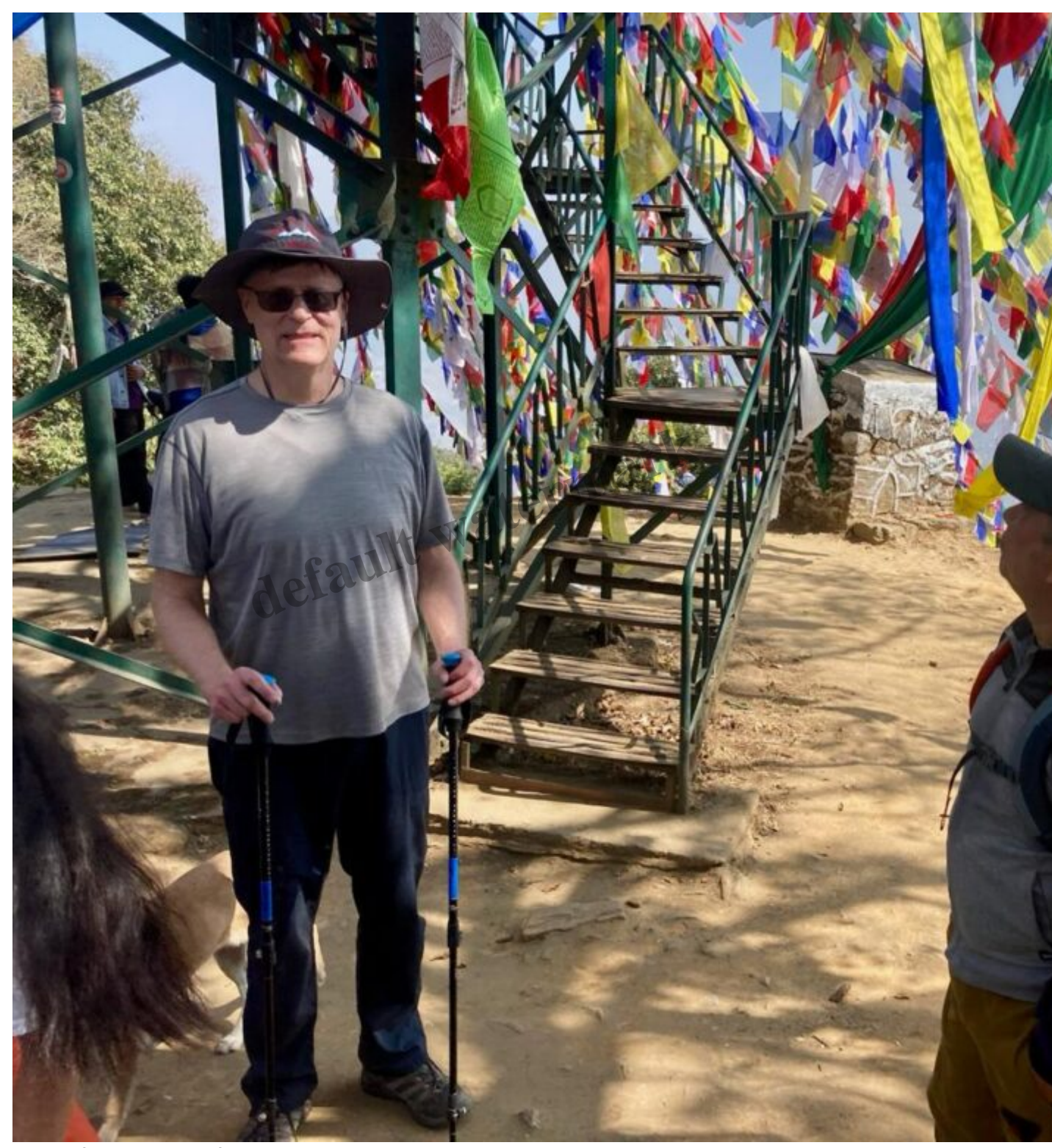
Really? More stairs?!

Our destination viewed from two-thirds of the way up