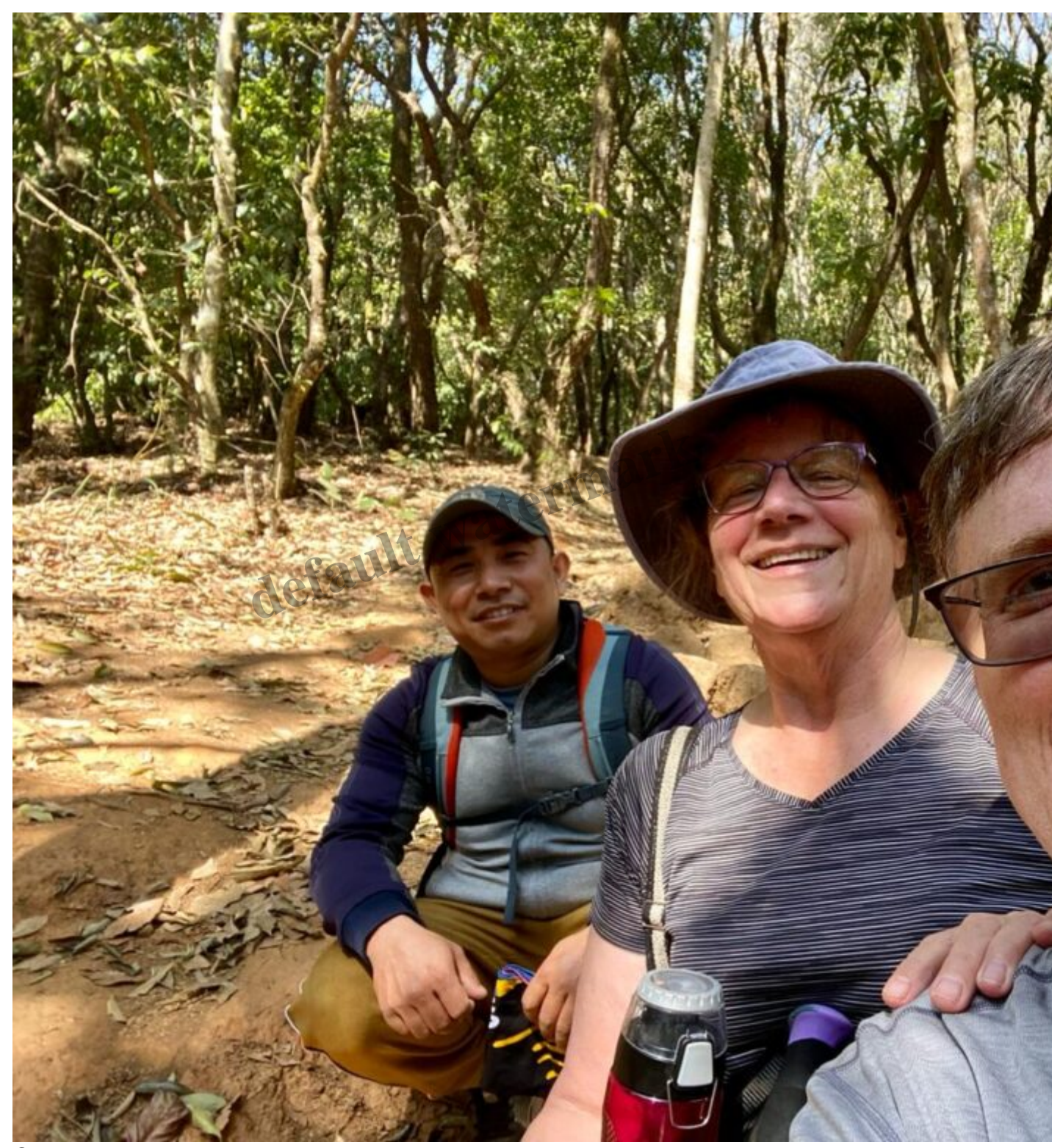
On the way up

We certainly increased our heart rates climbing those steep stairs! And the soreness of our muscles!