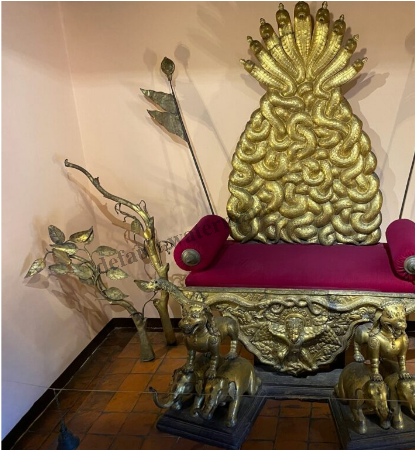
Throne for the non-ophidiophobic