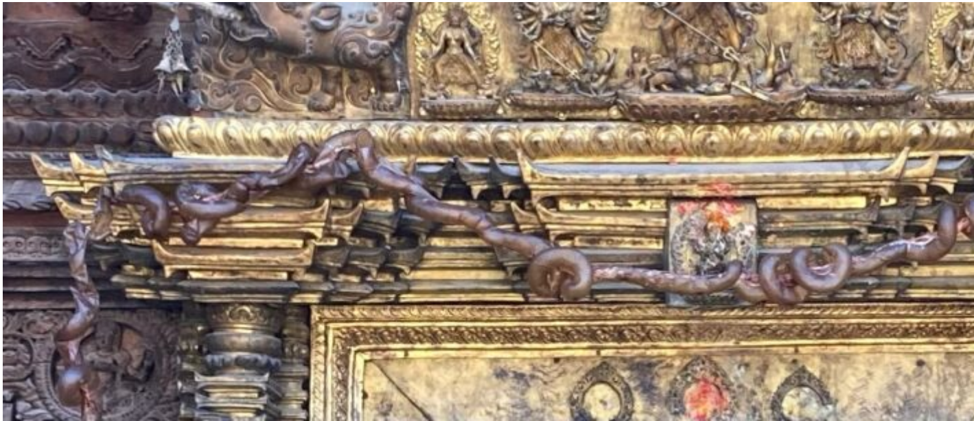
Close up — yep, those are goat intestines hanging over the door.

Royal is as royal does — but oh, the extravagances of royal privilege that were on display. Private spring water, a swimming-pool-sized “bathtub”, ornate thrones and clothes and the list goes on. (Royal subjects’ envy and resentment come as no surprise.) We saw some of this excess last week at Pokhara — where the royal family used to go on vacation — in the forest that was reserved for the king and his party to go hunting. Don’t even think about trespassing!