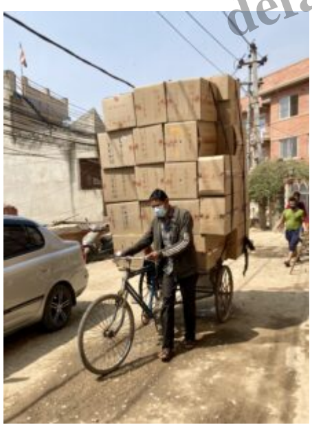
Quite the load outside of Days for Girls

The following day we had an Asia Area devotional over zoom. It was a great way to start the transition of responsibilities or shall we say pass the baton. After the devotional we went to a meeting to introduce the Nuffers to Maya at Days for Girls. We hope they are able to get a project going with that organization.