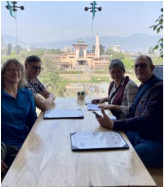
Neffs and Nuffers with the Royal Palace in the background.

The following day we had an Asia Area devotional over zoom. It was a great way to start the transition of responsibilities or shall we say pass the baton. After the devotional we went to a meeting to introduce the Nuffers to Maya at Days for Girls. We hope they are able to get a project going with that organization.