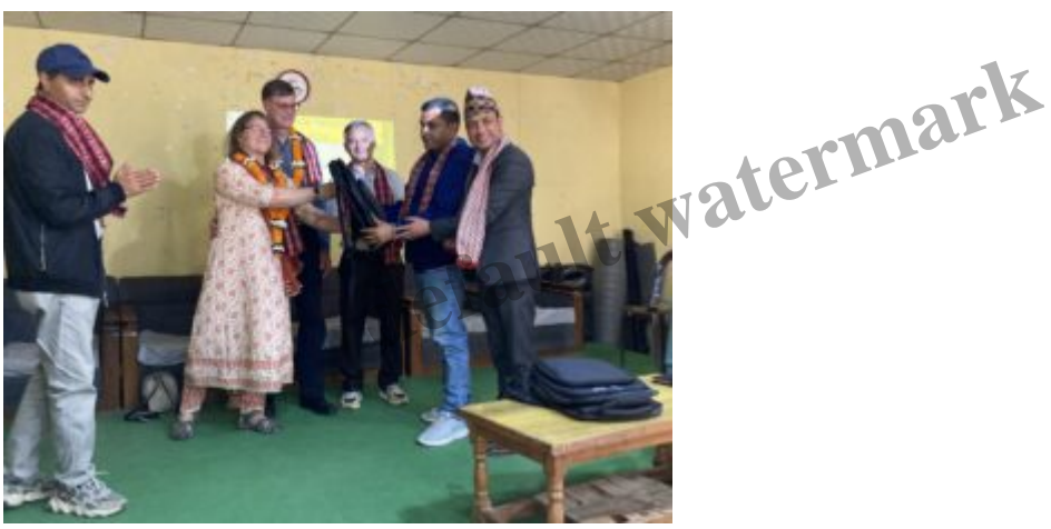
Handing over a hygiene kit

Our replacement couple arrived in the evening and they were equal parts excited and exhausted. It takes time to adjust to a 12 hour time change. The good thing is that traveling for 30 hours means you are so tired that you can sleep anyway.