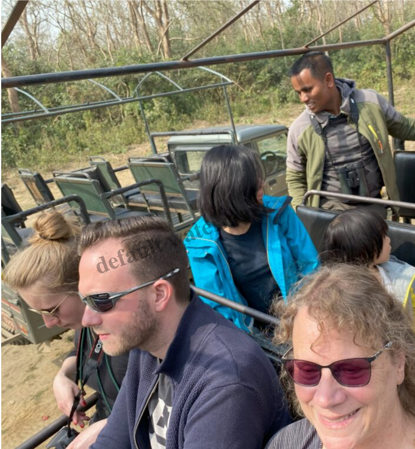
Ready to safari!