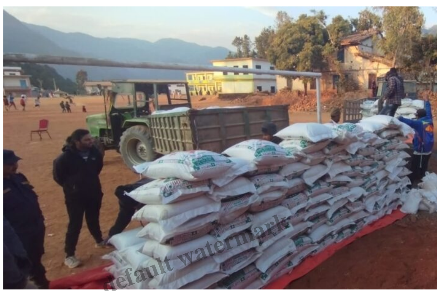
Food ready to be distributed.