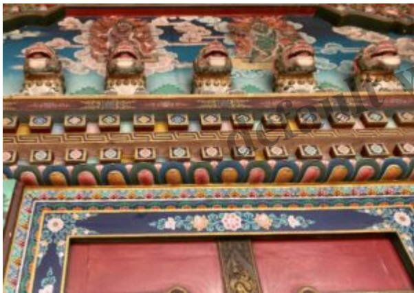
On a wall of the monastery