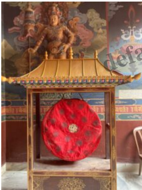
Gong in the monastery