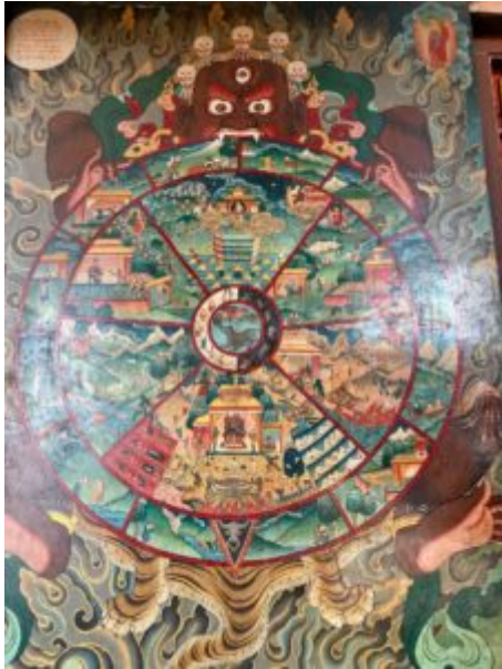
The Buddhist Wheel of Life (with sweet spot in the middle!)