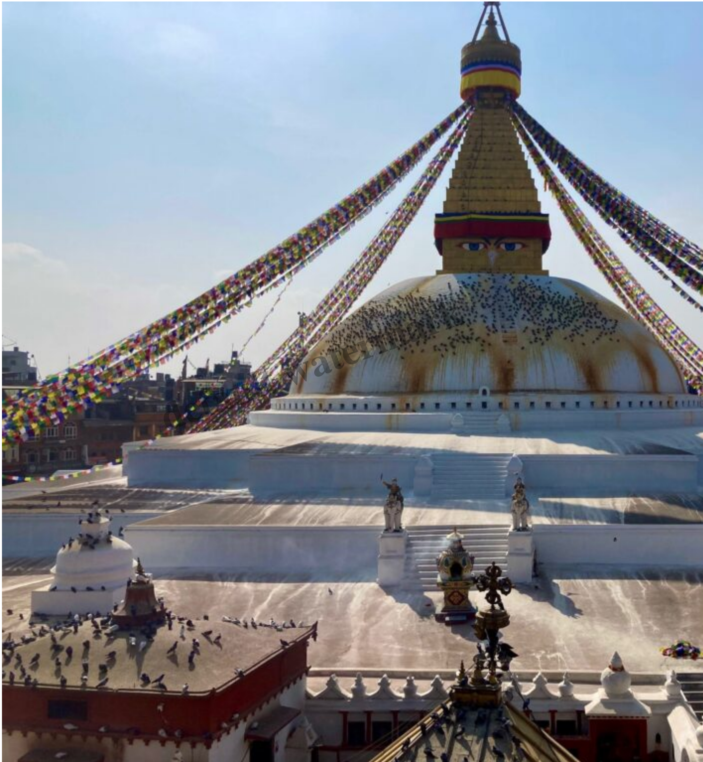
View of Stupa from Monastery