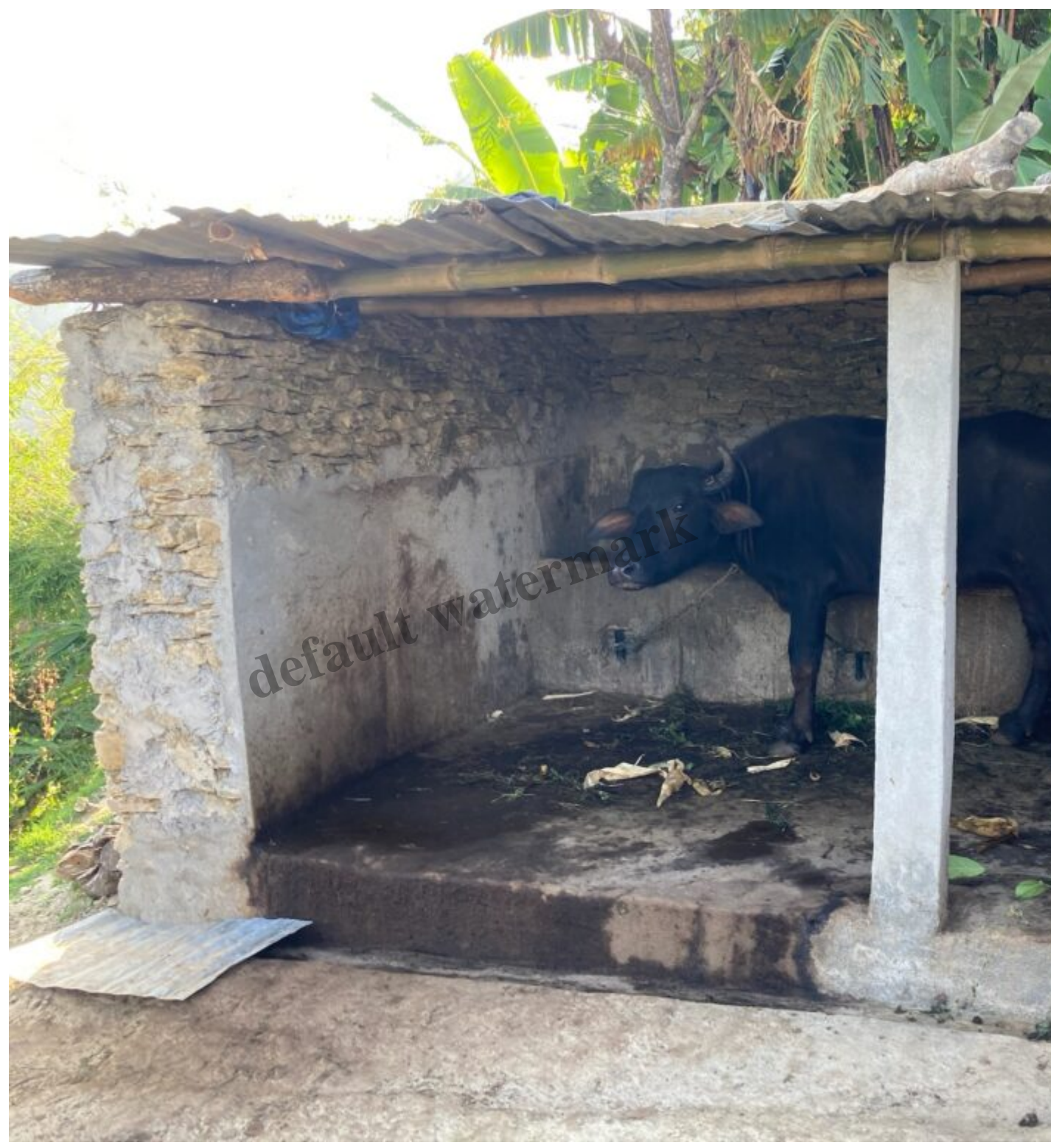
I like my new shed!