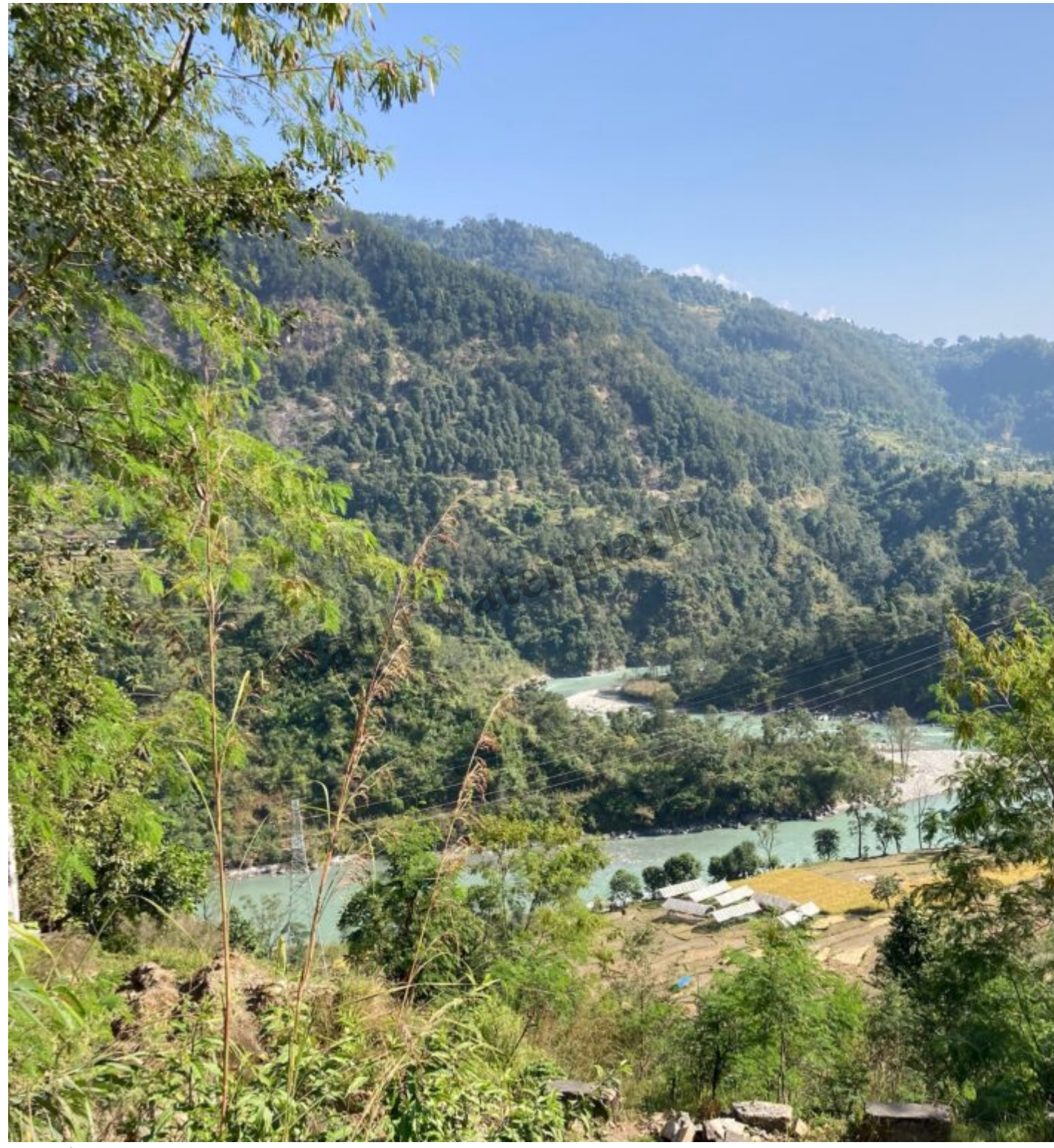
View from the hillside

The best part of our trip? Seeing the people who didn't before but now have clean, safe water so conveniently available at (though not in) their homes, so happy and so very grateful to those who made it possible and made it happen.