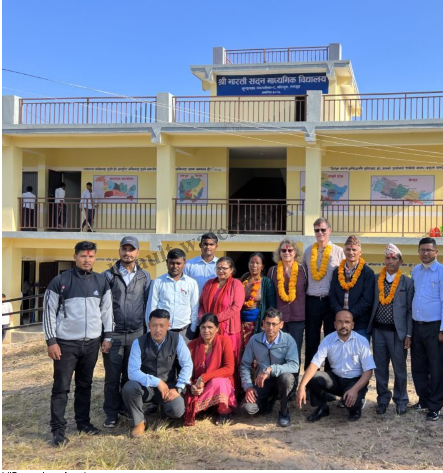
VIPs posing after the ceremony

This is a school that CHOICE supplied with water and some furniture. Kiran told us later that they took a survey asking the students what they valued the most. Overwhelmingly they answered "water" — because its availability at their homes meant they could actually go to school — their mothers could be home to fix them breakfast instead of needing to make the 3-4 hour journey to fetch water each