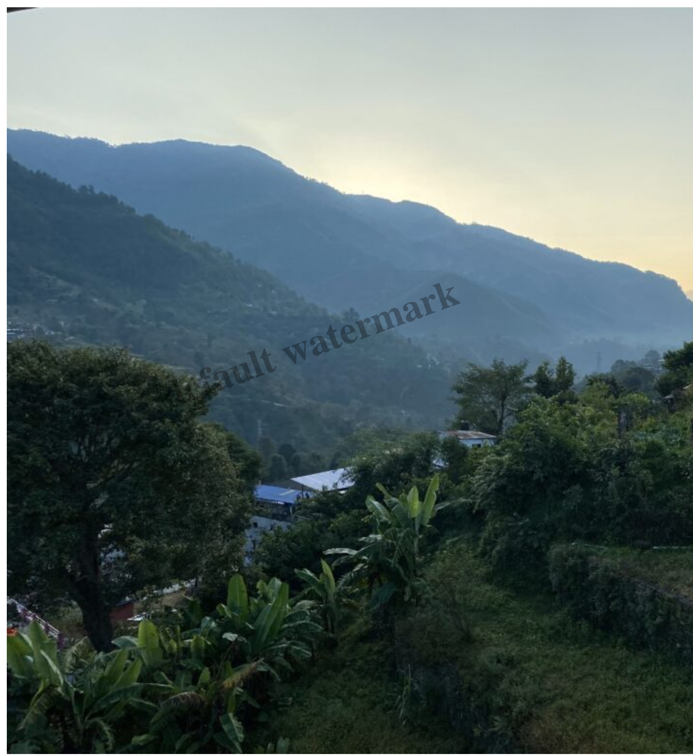
Early morning view at our hotel in Besishahar