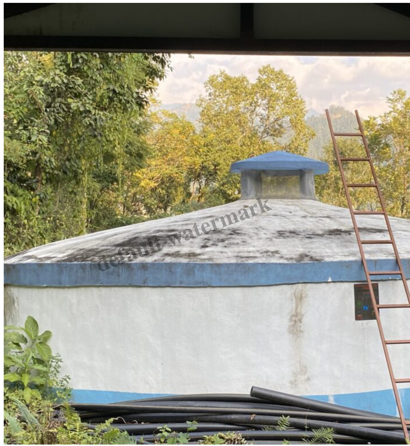
A water storage tank near Besishahar