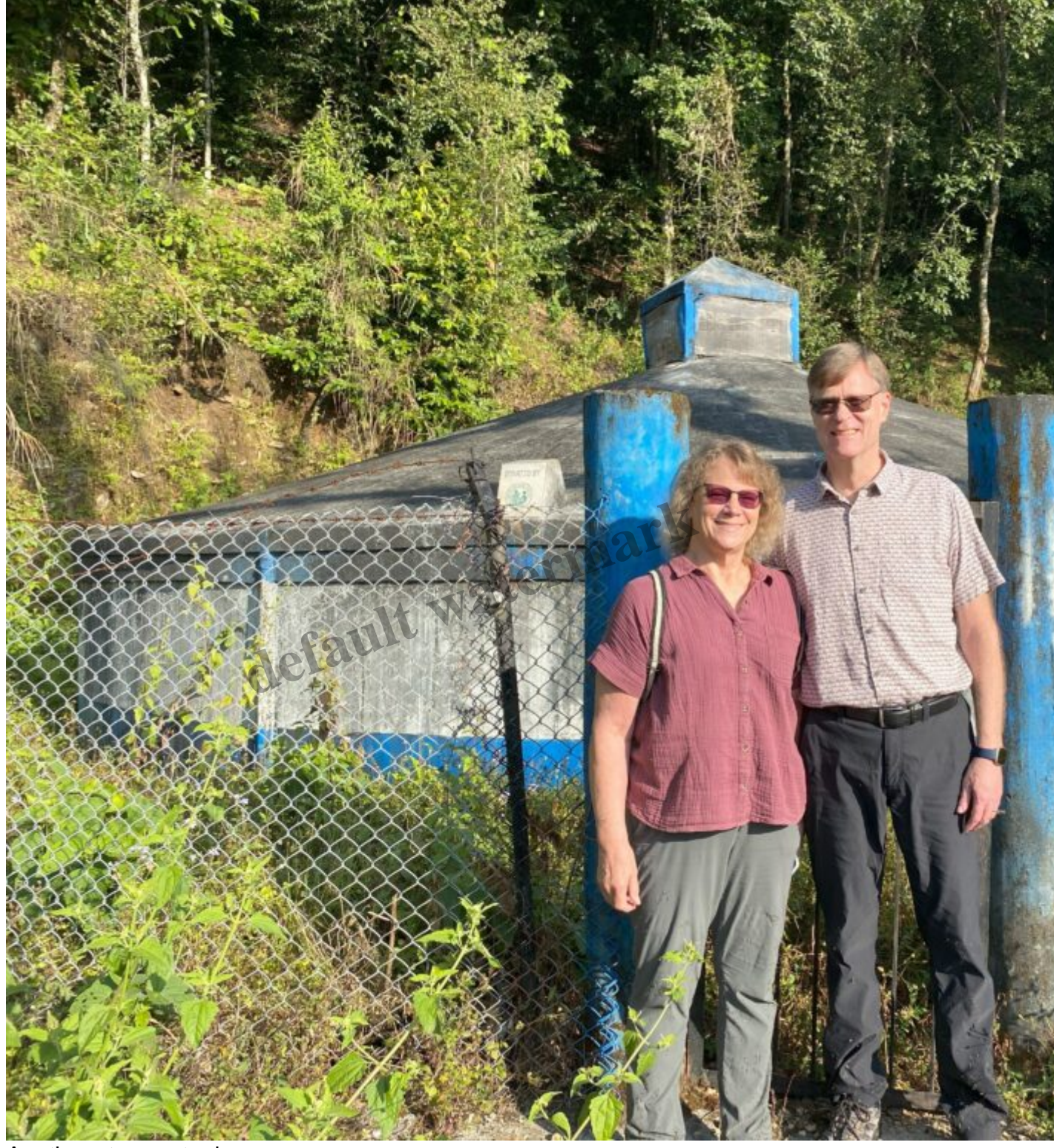
Another storage tank