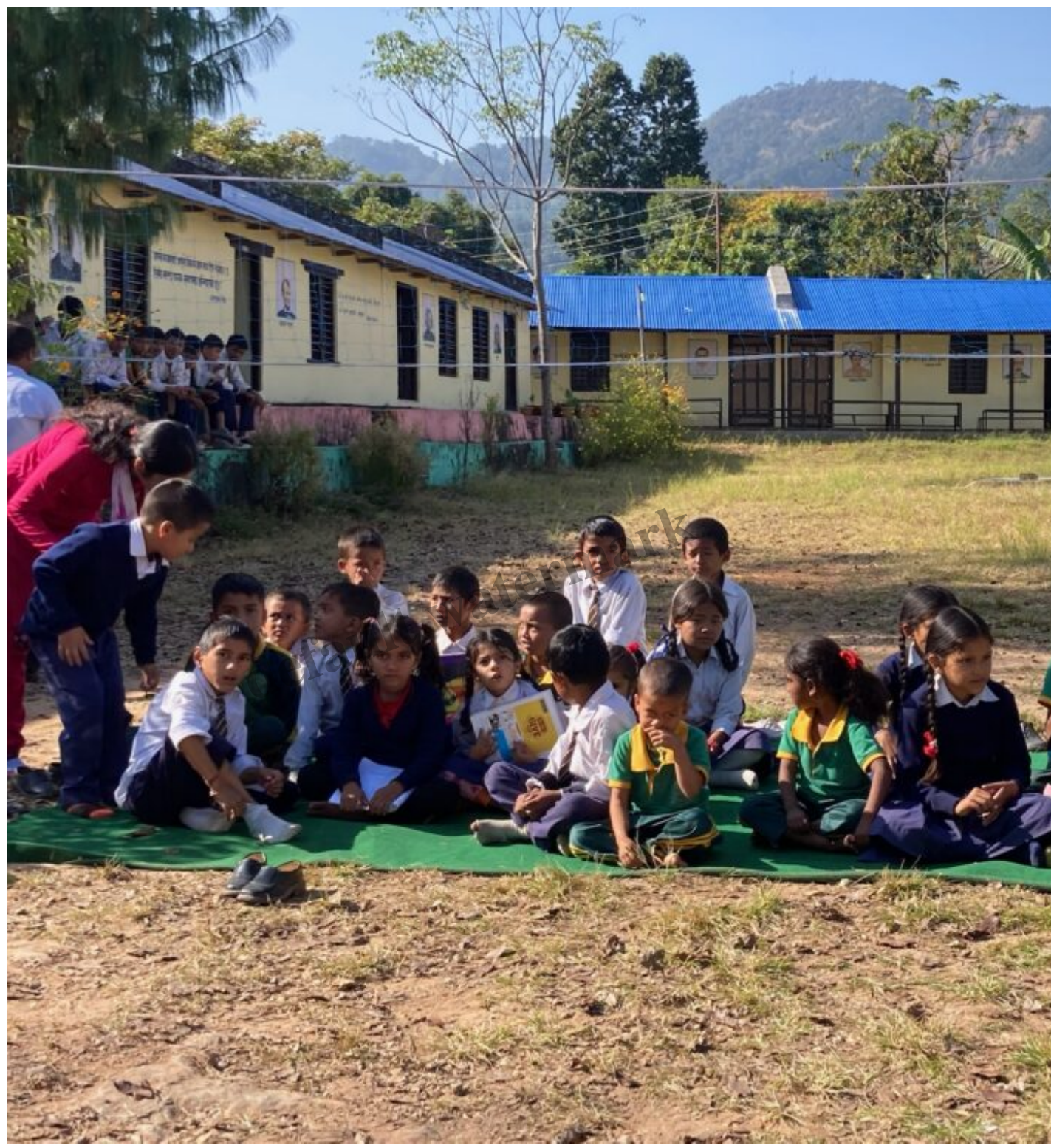
Schoolchildren gathering for the ceremony