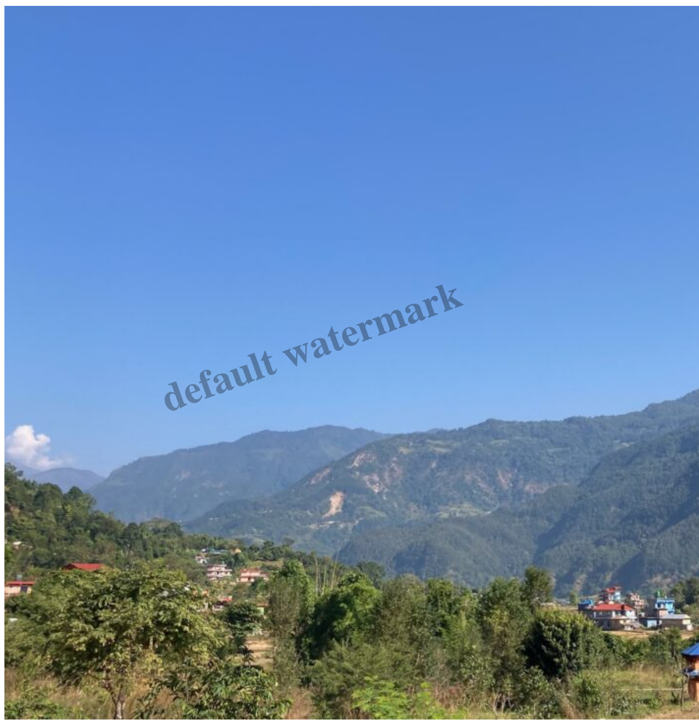
A beautiful day, a beautiful hillside