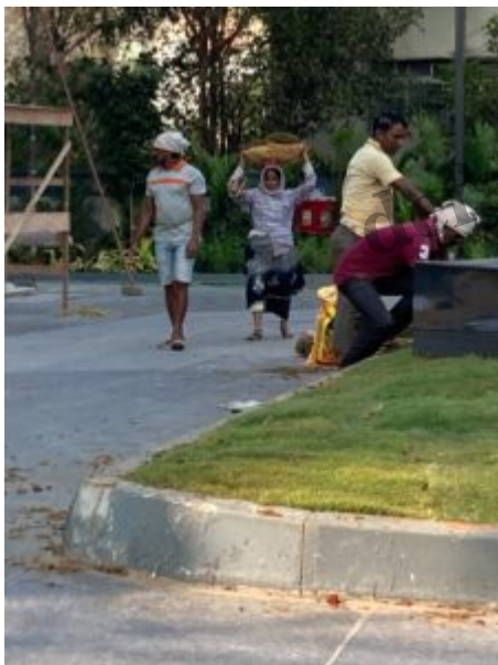
Carrying sod on her head — no wheelbarrow?!