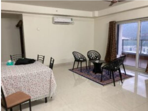
Dining and living room