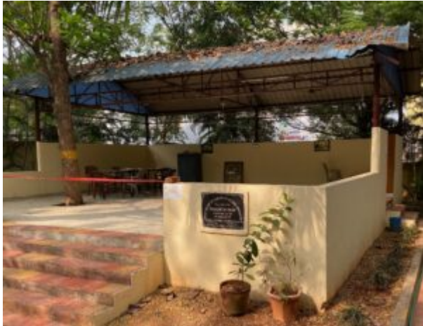
Prasanthi Park pavilion