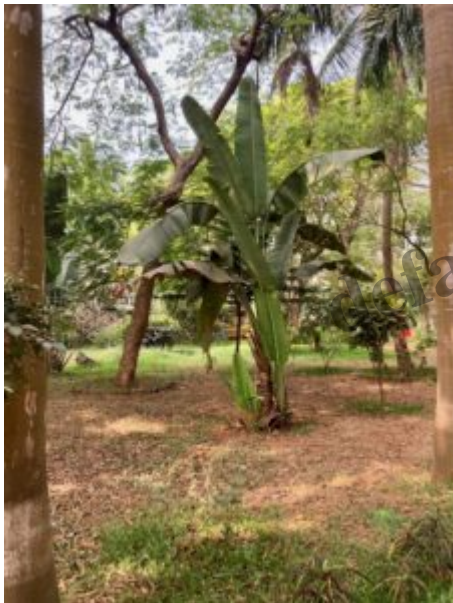
Foliage in the park