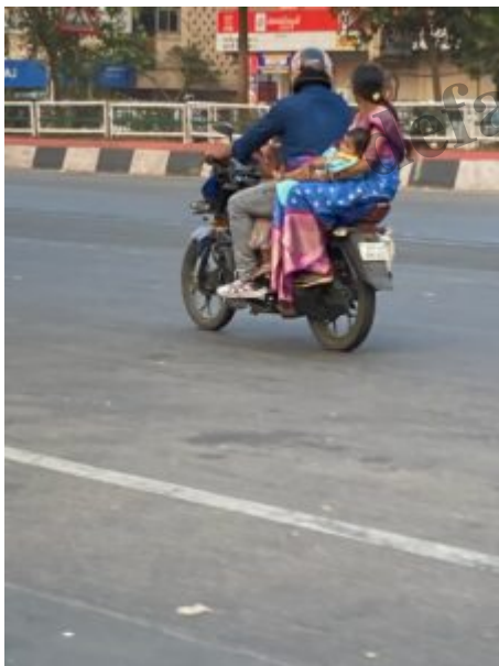
What child safety laws?!