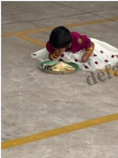
Either that or eat standing up

After coming back to the apartment, we decided to look for a grocery store nearby. Google maps found one, which turned out to be a hole-in-the-wall type of store, not exactly what we were looking for, so we went with Google Maps' second choice. It then led us on a walk through a slum, which elicited a lot of stares and giggles, mostly from the little kids. But some of the adults looked at us warily, almost like we were intruders in their realm. And when we got to the Google Maps' destination point, the store wasn't there! We asked and got directions to another one about half a mile further, so we were still able to pick up a few groceries. It made us smile that 6-8 employees of that modest store drew near and competed for the opportunity to try to help us find what we were looking for!