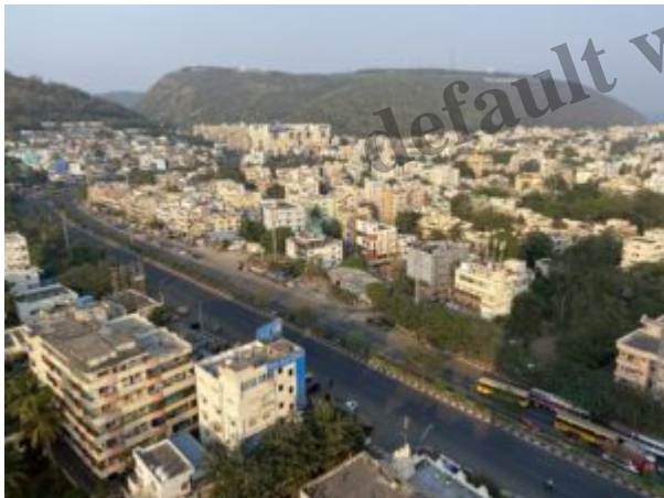
View from the balcony on the 17th floor