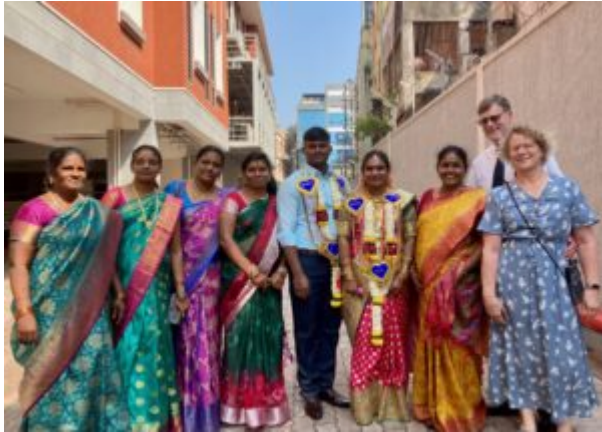
Bride and groom with family and new friends