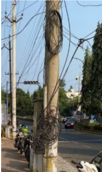
Cringeworthy electrical wiring