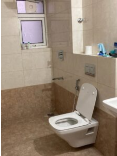
One of three bathrooms — shower curtain coming!