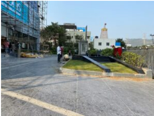
Laying sod at Lansum Square entrance

big supermarket. We picked up a few more essentials and were disappointed at what we couldn't find — like vanilla extract for making chocolate-chip cookies, or banana bread. But we ordered that and some other hard-to-find things online.