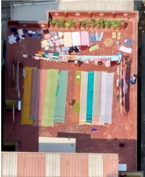
Yes, those are saris (and other clothes) drying on the rooftop below