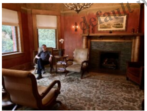
Relaxing in the room featuring the original 1906 decor