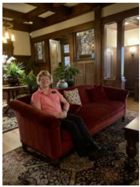
Enjoying the change of pace