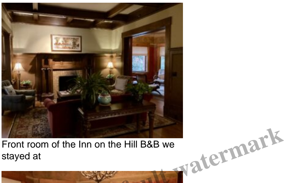
Front room of the Inn on the Hill B&B we stayed at